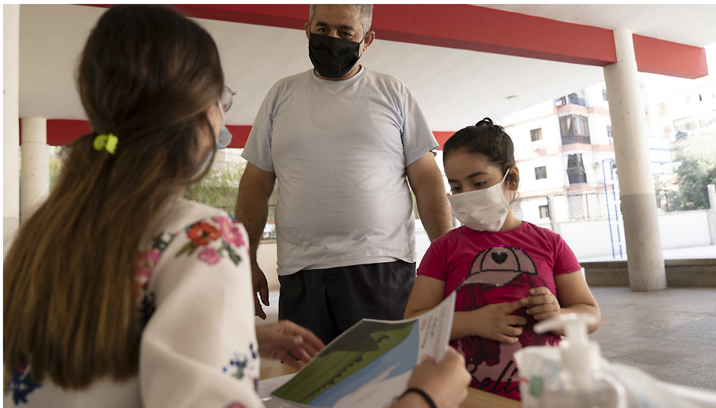
Left: Students attend a class in Lebanon. Above: Students in Lebanon pick up remote learning packets provided by Theirworld.

We continued to campaign for international donors and individual governments to increase investment in ECE to 10% of their education spending. Our campaign had early success with UNICEF and Education Cannot Wait making the 10% commitment, which represents more than £72 million for early childhood education annually. We followed this up by campaigning for the Global Partnership for Education, a major fund which supports education in lower income countries, to enshrine the commitment in its next five-year, $5 billion education investment strategy.