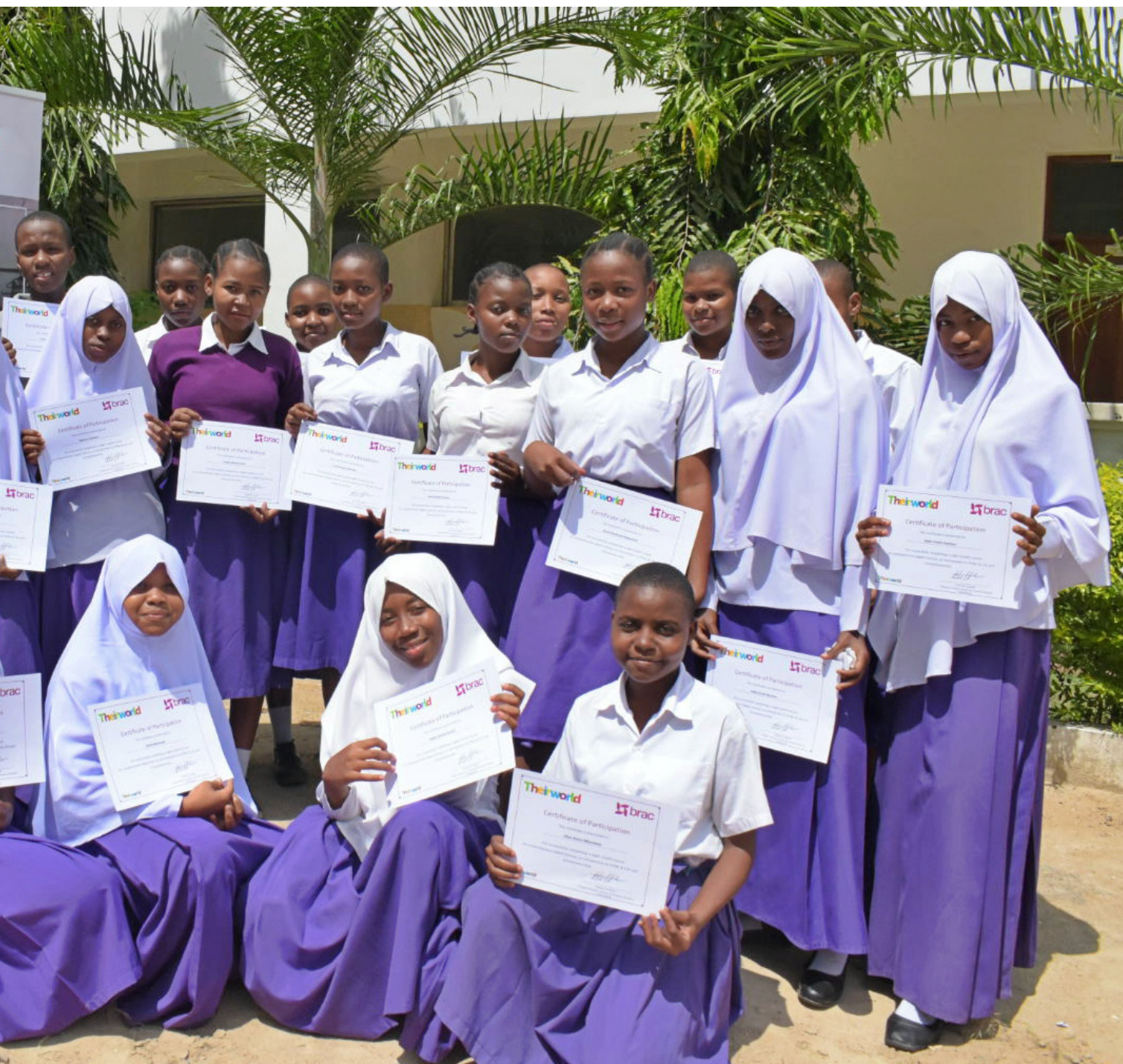
Girls in Tanzania complete the Theirworld Skills for Their Future programme in collaboration with BRAC.