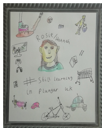
Nick Sharratt launched the #StillLearning campaign inspiring children around the world to share drawings about what they were learning during lockdown.