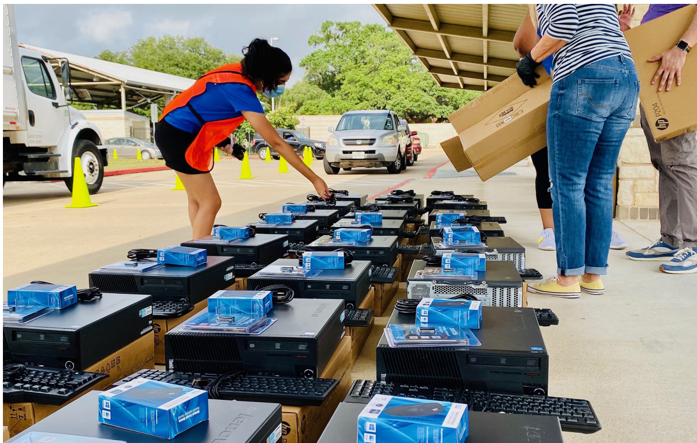
The Global Business Coalition for Education partnered with HP and non-profit organisation Comp-U-Dopt to deliver devices to support remote learning in U.S. cities.

In response to Covid-19, GBC-Education worked with companies through its Rapid Education Action (REACT) initiative to cultivate a set of resources from the business community to support education and distance learning during the pandemic. Dozens of companies participated, and more than 100 resources were made available to governments, school systems and educators. In the United States, 7,600 computers were distributed to learners in underserved communities in Chicago, Houston and Dallas through a partnership with HP and the US-based non-profit organisation Comp-U-Dopt.