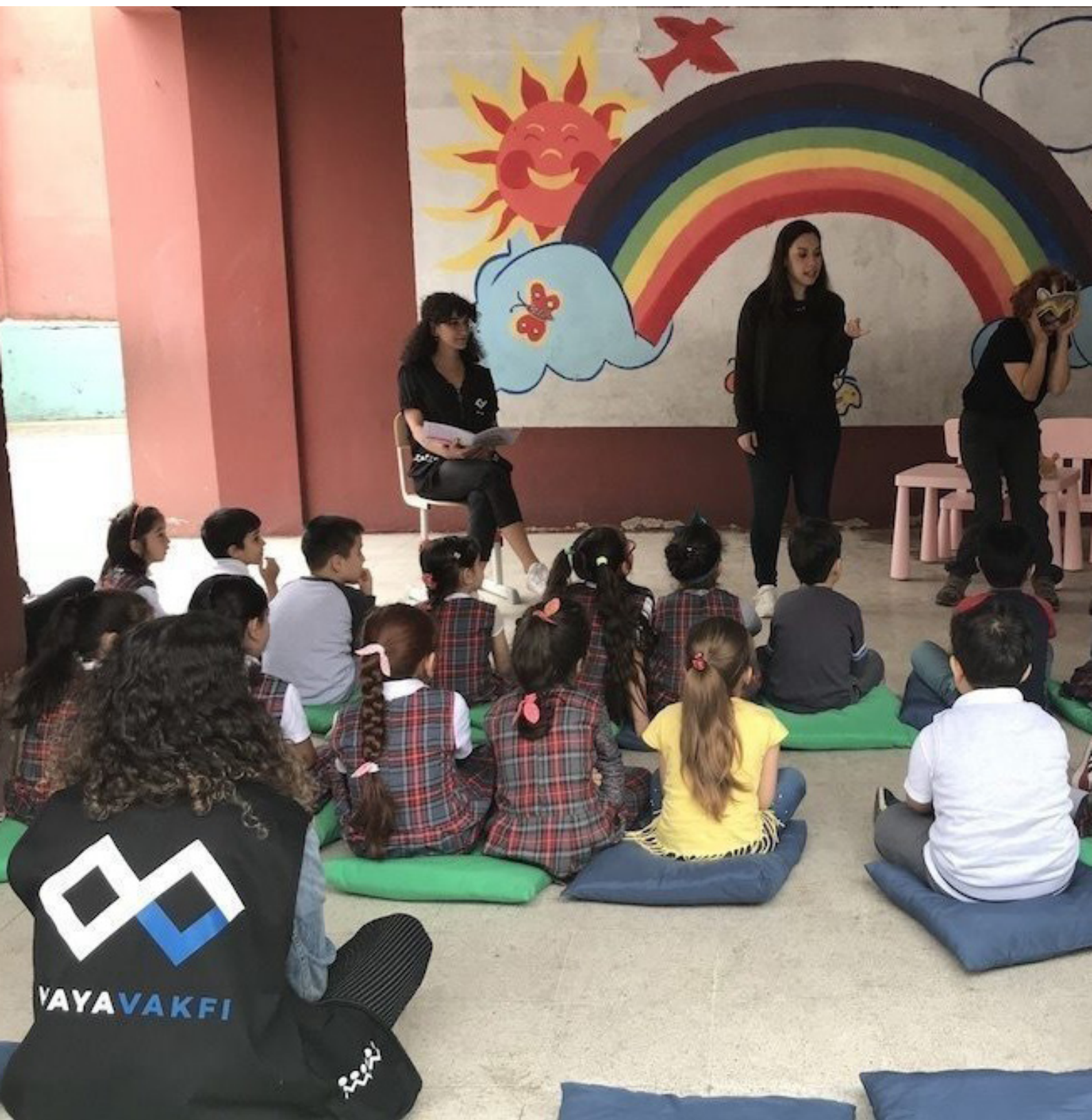
Syrian children attending a class in a Turkish public school benefiting from the Trauma Informed Schools project.